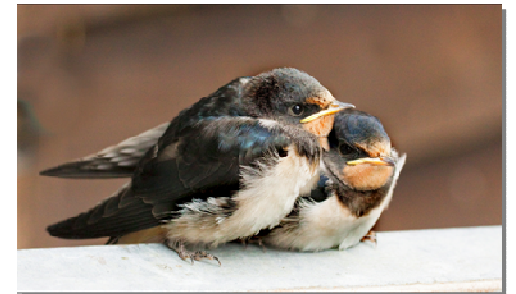
Bruce Deacon - Young Swallow

Affiliated to the Photographic Alliance of Great Britain through the East Anglian Federation of Photographic Societies.