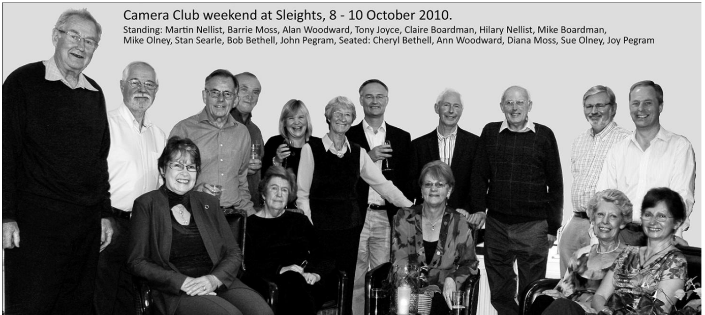
Camera Club weekend at Sleights, 8 - 10 October 2010.