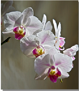
Simon Bray - Orchid:Phaleanopsis