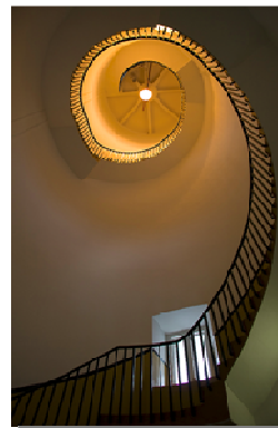
Steve Ridgway LRPS - Inside Southwold Lighthouse